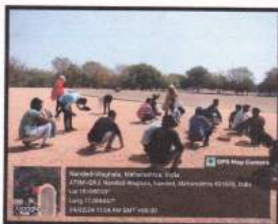
Shram Dan at SRTMU Campus