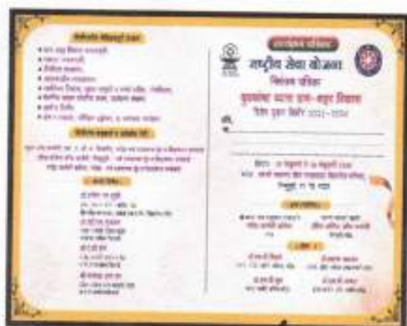
Collaborative activities in NSS Camp