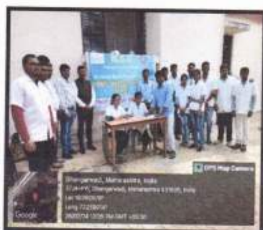
Blood group detection camp