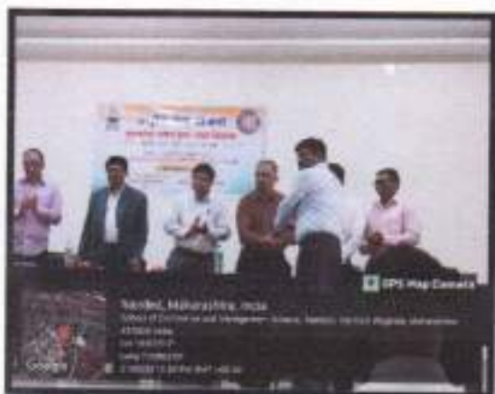
NSS Camp inauguration