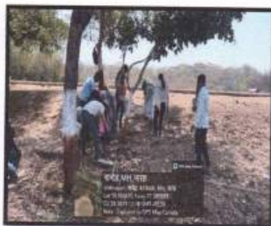
Shram Dan at SRTM University Running track